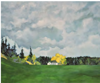
Image Credit: Pat Grayston, Petey and I , collage on embossed paper, 25x21", 2019

VAULT GALLERY: These are the places in our neighbourhood Jennifer Conneely November 24–January 23, 2021